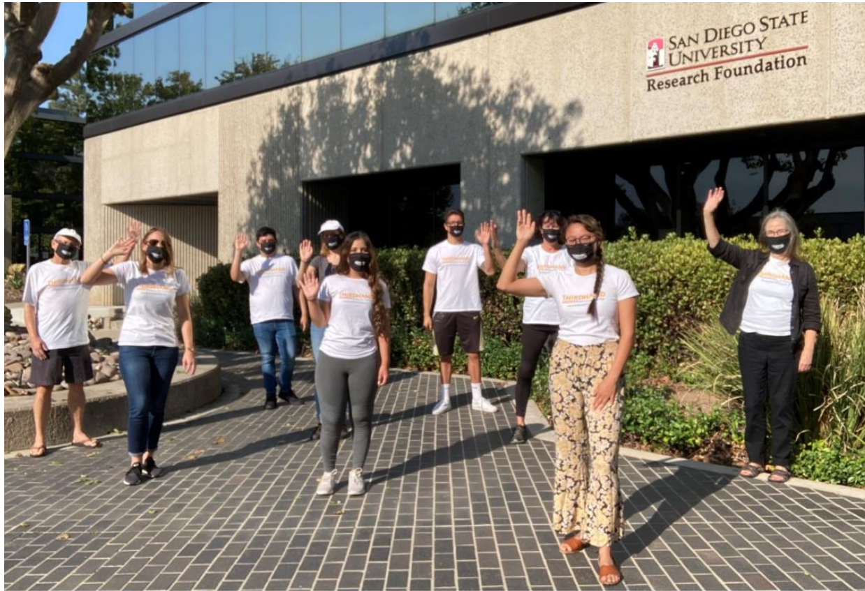
Breath of Life Walk 2020 with Breathe CA of the Bay Area